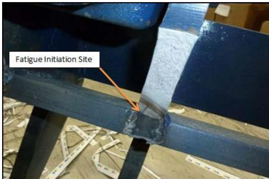
Figure 1 – Discharge-Door Locking Bar Failure Site

This cyclic stress caused fatigue cracking in the discharge-door locking mechanism in six of nine Max-Pak hydraulic paper balers owned by the employer in the MOSH case. The complete separation of the discharge-door locking bars from the locking mechanism resulted in a worker fatality in the MOSH case. In this case, all four discharge-door locking bars separated from the discharge-door locking mechanism, allowing the discharge door to swing open with deadly force.