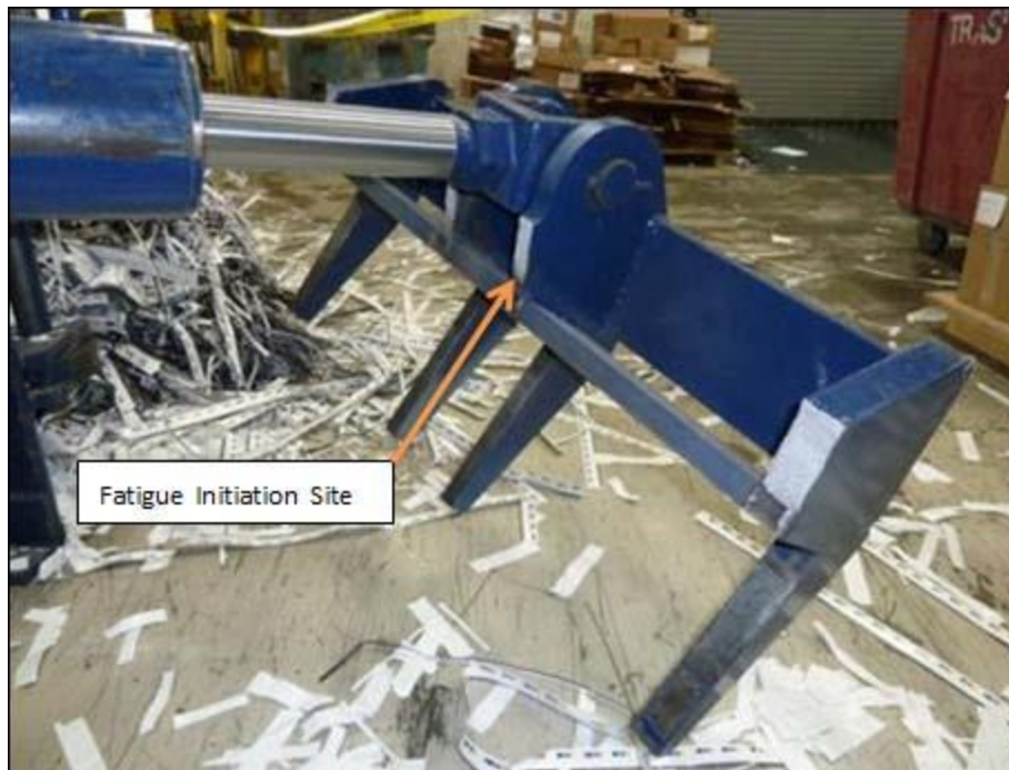
Figure 2 - Failed Discharge-Door Locking Mechanism

The fatality occurred as the paper baler was compressing a load of scrap paper. With fatigue cracks already in advanced stages, the discharge-door locking bars failed catastrophically. Complete failure of the discharge-door locking bars allowed the heavy discharge door to swing open, fatally injuring a worker located near the end of the baler. The failed locking bars are part of the 1st generation (original) design of this equipment. (See Figure 2 below.)