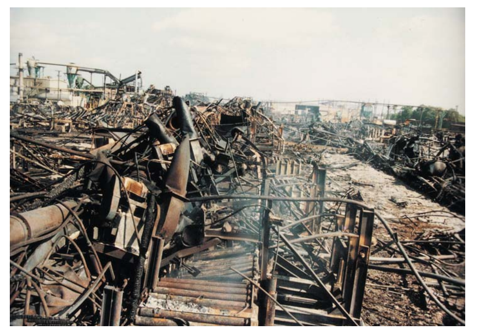
This plywood mill crumpled into twisted metal, shattered glass and ashes, as a US$59.7 million fire swept through it. An obstructed sprinkler system allowed the fire to burn freely. Only a few buildings inside this large complex were left standing, and none of the raw material was salvageable. All production ceased indefinitely.